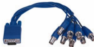
9-16 Cams Video Cable