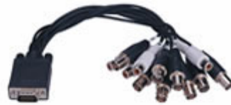
1-8 Cams Video/Audio Cable