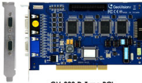
GV-800 D-Type PCI