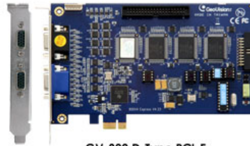
GV-800 D-Type PCI-E